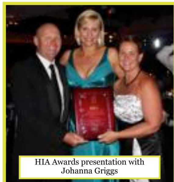
HIA Awards presentation with Johanna Griggs